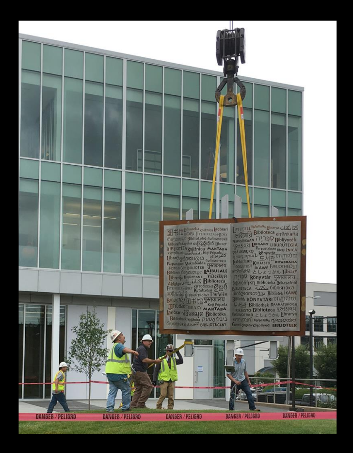
DeeDee Morrison, Timeless Purpose, Forsyth County Central Library, 2017