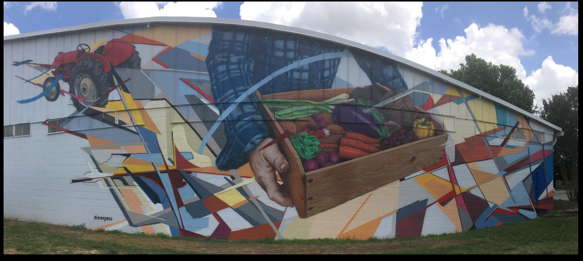
Hieronymus, Winston-Salem Fairgrounds Farmers Market, 2020

Include public art in future City and County investments, such as parks, libraries, recreation centers, greenways, and streetscape improvements.