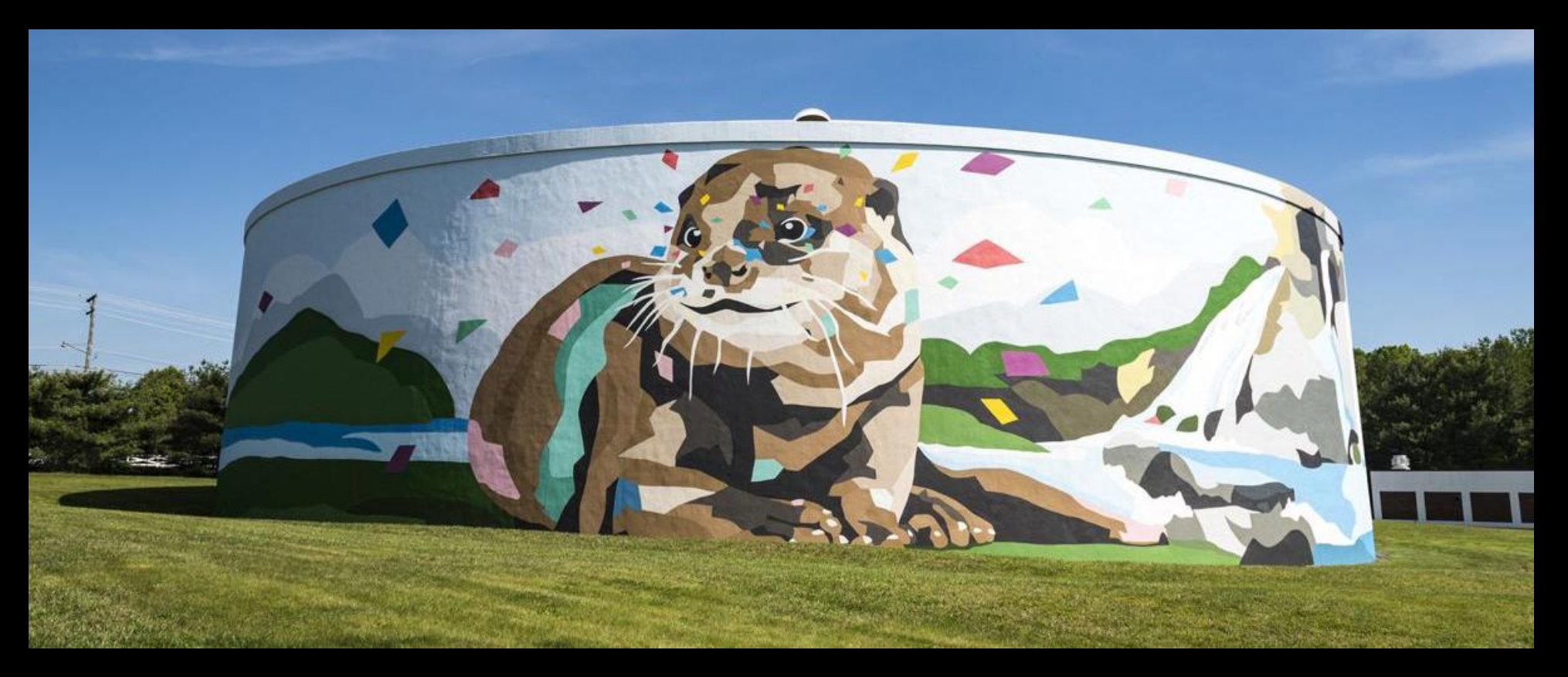
Daas, Daybreak Along the River, 2017

Increase public art funding for projects at existing parks, greenways, libraries, municipal buildings, Downtown Winston-Salem, and neighborhoods.