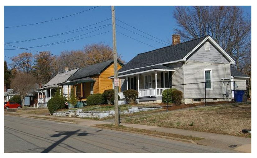
Figure 1: Houses along Chapel Street

providing housing variety. The County's large suburban single-family housing supply reflects the larger household size of the past, and multifamily choices are represented mostly by mid-size apartment buildings rather than an array of building types at various scales. Some current local provisions do allow for more land-efficient residential development, however. These include the Planned Residential Development use which allows for a decrease in residential lot size in return for increased open space requirements. In fact, PRDs have no