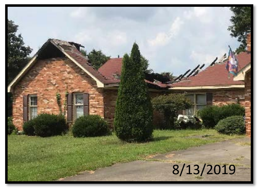
C-7221 McTavish Lane