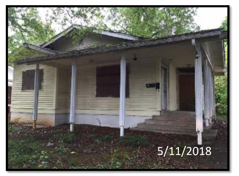
C-6 2936 Patterson Ave