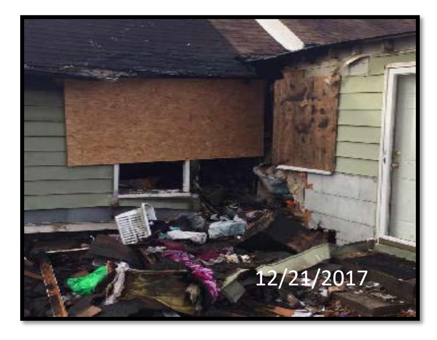
C-5 3100 Airport Road