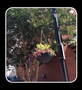
6. Flower Baskets