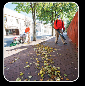
4. Leaf & Snow Removal