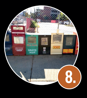
8. Newspaper Racks