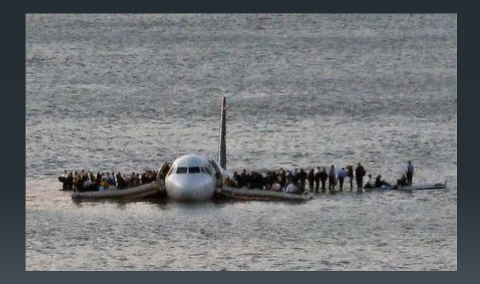
US Airways Flight 1549 – Miracle on the Hudson. January 15, 2009

Airports reduce the risk of wildlife strikes though integrated wildlife management programs. These programs include changes to the habitat at and in the vicinity of the airport and methods to disperse or remove the birds and other wildlife that pose a risk to aviation safety.