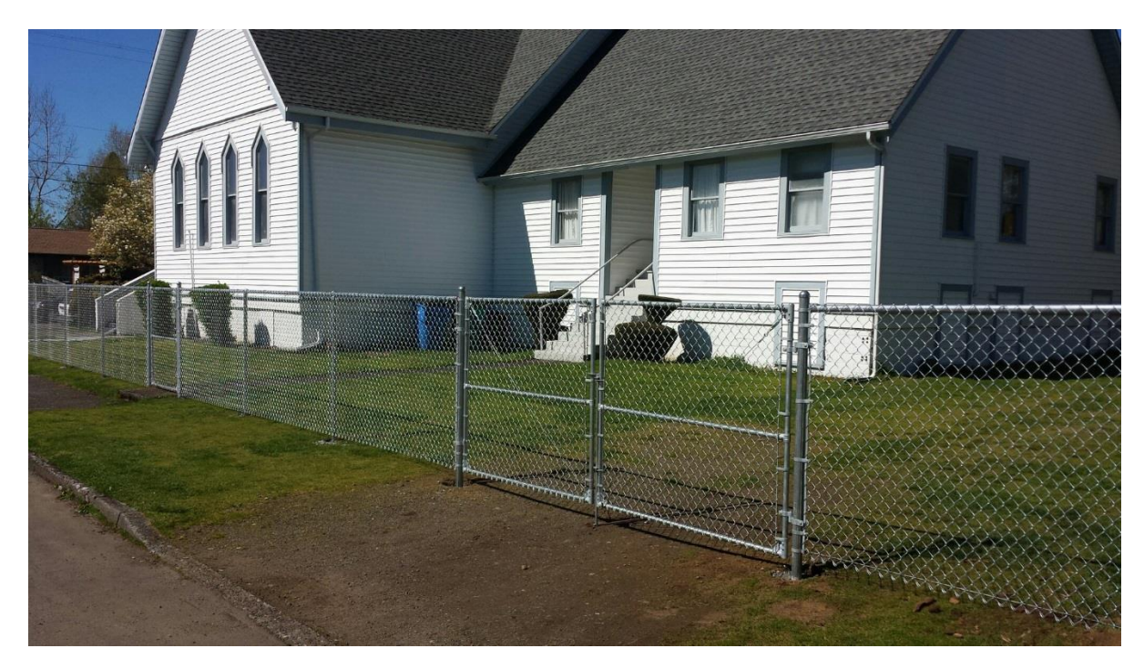
Opacity of 50% or less (50% or less of the area of the fence is not able to be seen through).