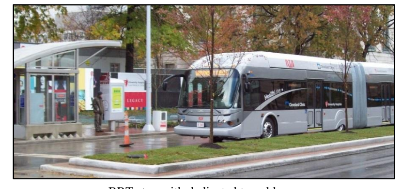
BRT stop with dedicated travel lanes

BRT is typically comprised of large, articulated