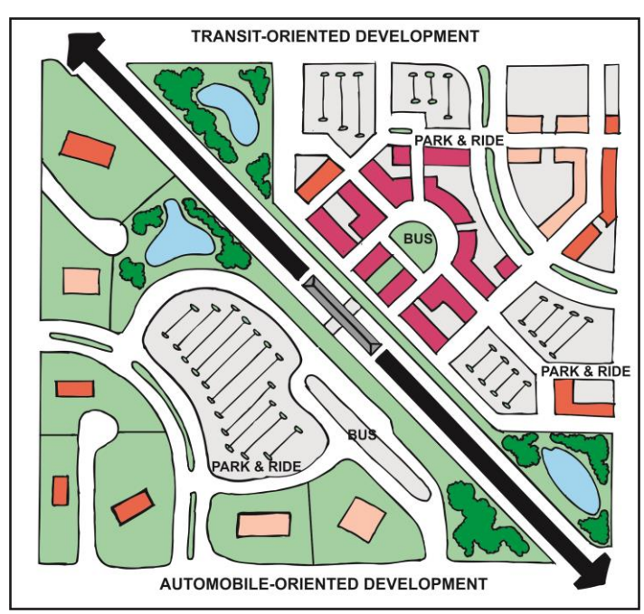
Auto-oriented development vs TOD

Currently, there is no TOD development in Winston-Salem, and while premium transit exists or is being planned in multiple locations, including the Charlotte Blue Line and the Durham-Orange Light Rail, TOD projects in North Carolina are relatively limited. Charlotte has an extensive ordinance for TOD included as part of its Transit Oriented Development Districts, which act as zoning overlay districts. Requirements of the district include urban design standards, including minimum setbacks; minimum residential density requirements of 20 dwelling units per acre within ½ mile of transit stations; streetscape