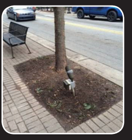
7. Tree Fencing