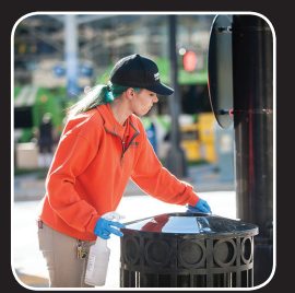
2. Trash Cans & Cigarette Receptacles