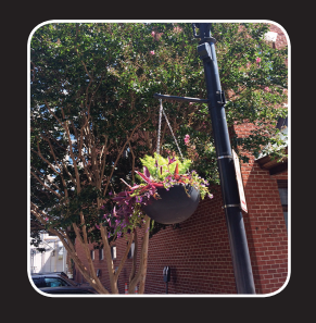
6. Flower Baskets