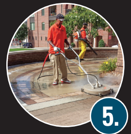
5. Power Washing