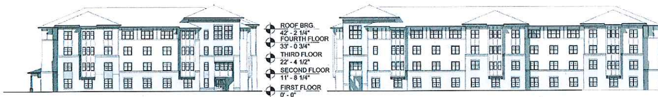
NORTH ELEVATION (12TH ST.)