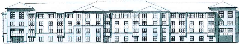
WEST ELEVATION (HIGHLAND AVE.)