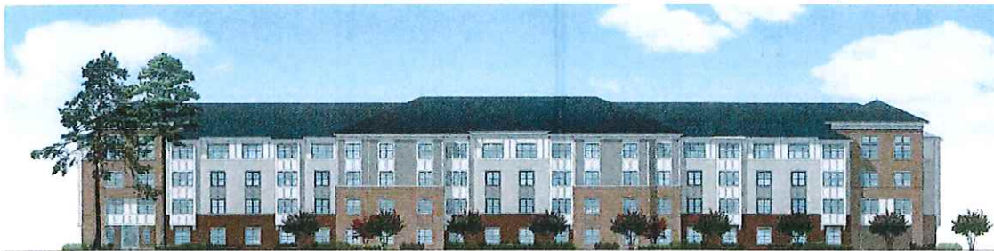
WEST ELEVATION (HIGHLAND AVE.)