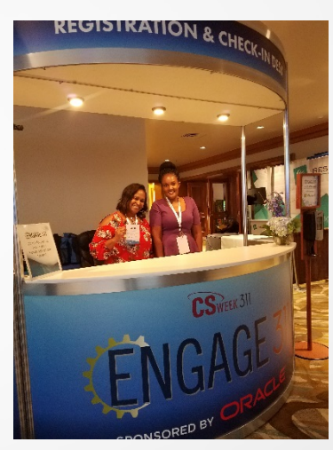
Network & Innovate