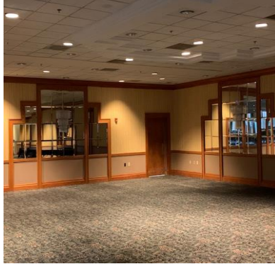
Carpet, Wall Coverings