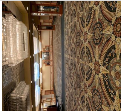
Big House Gaines Ballroom