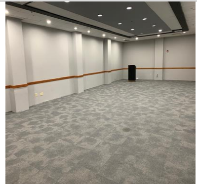
Breakout Room (Ardmore 1)