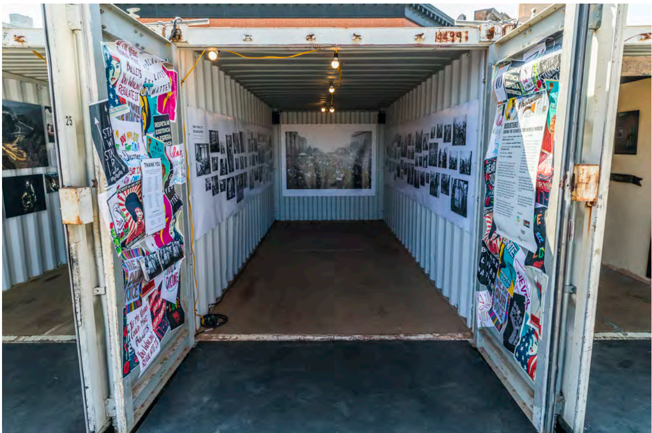
ReSisters : Behind The Scenes of The Women's March multi-media installation. Photoville 2013