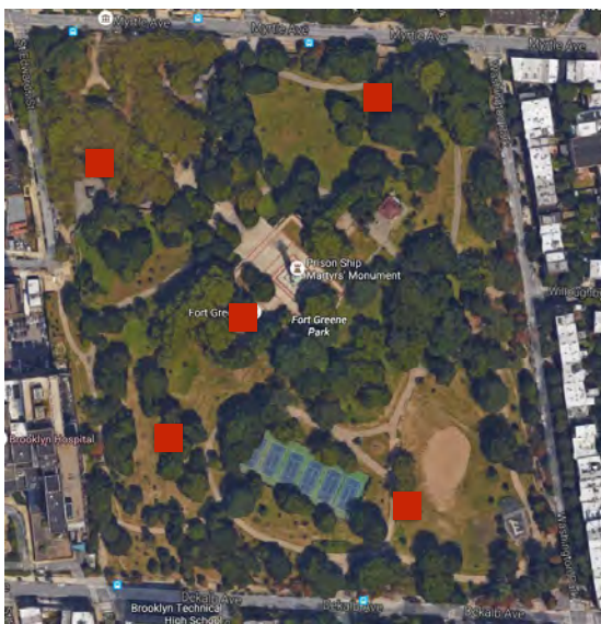
Map of possible cube locations

The images below are renderings of exhibition, currently in production.