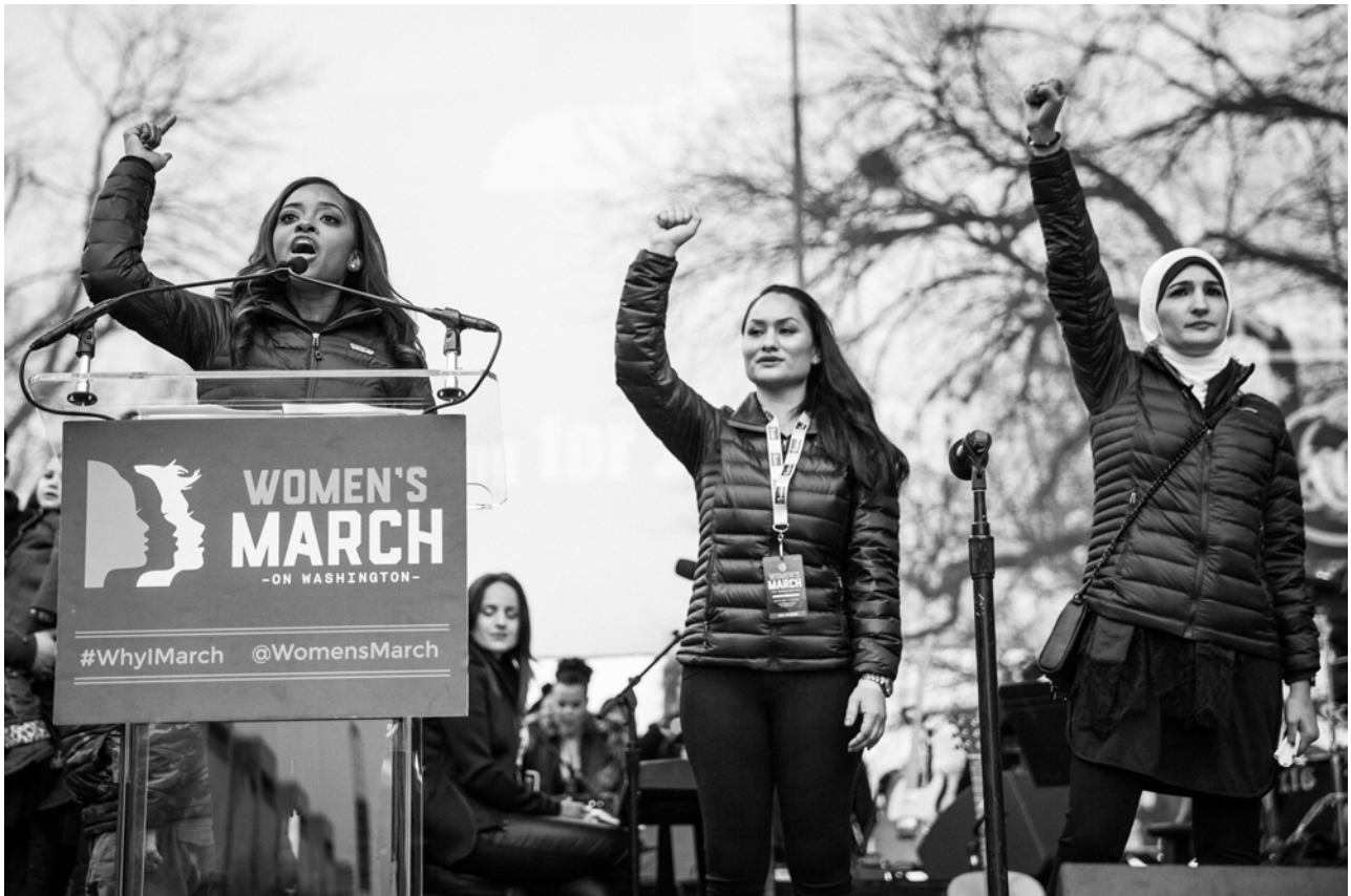
Jan 21, 2017. Tamika Mallory and her sisters Carmen Perez and Linda Sarsour.