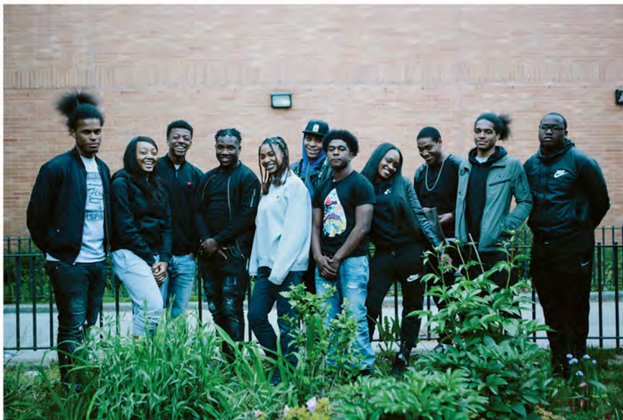
Community Heroes, NYC Graduating Seniors