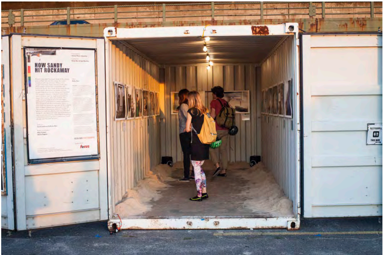
How Sandy Hit Rockaway multi-media installation. Photoville 2013