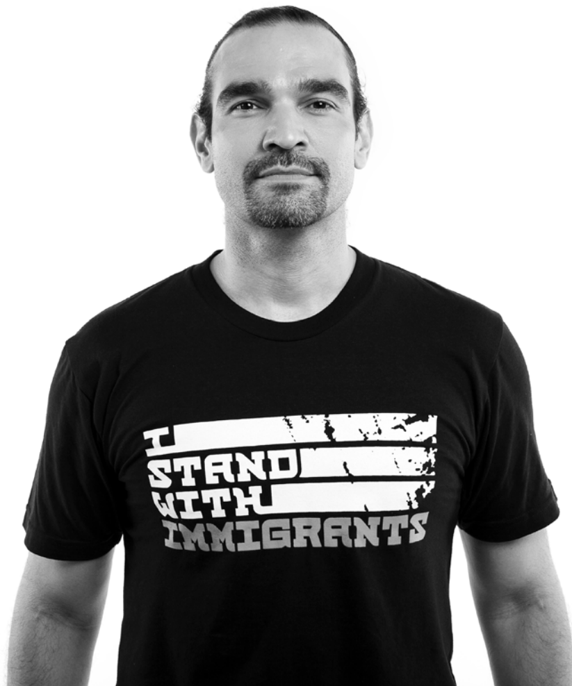
Javier Muñoz Actor / Hamilton