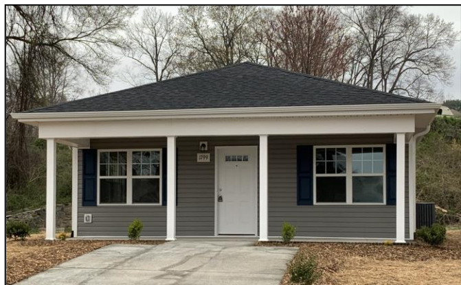
House in Glenn Oaks

The use of HOME funds for multi-family projects is principally reserved, as a policy decision, for Low-Income Housing Tax Credit projects or projects sponsored by non-profit, public agency entities, given the complexities of the HOME Program affordability restrictions; however, proposals may be reviewed on a case-by-case basis or for projects serving special needs populations.