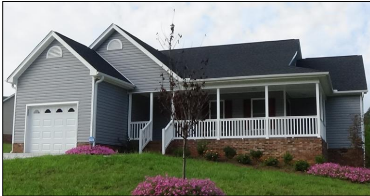
Ridgewood Place House

Support home ownership by lower income households; foster production of single- and multi-family housing for lower income households and persons with special housing needs through new construction, conversion and adaptive reuse; promote energy efficiency; and provide incentives to develop housing for all income groups and to promote opportunity.