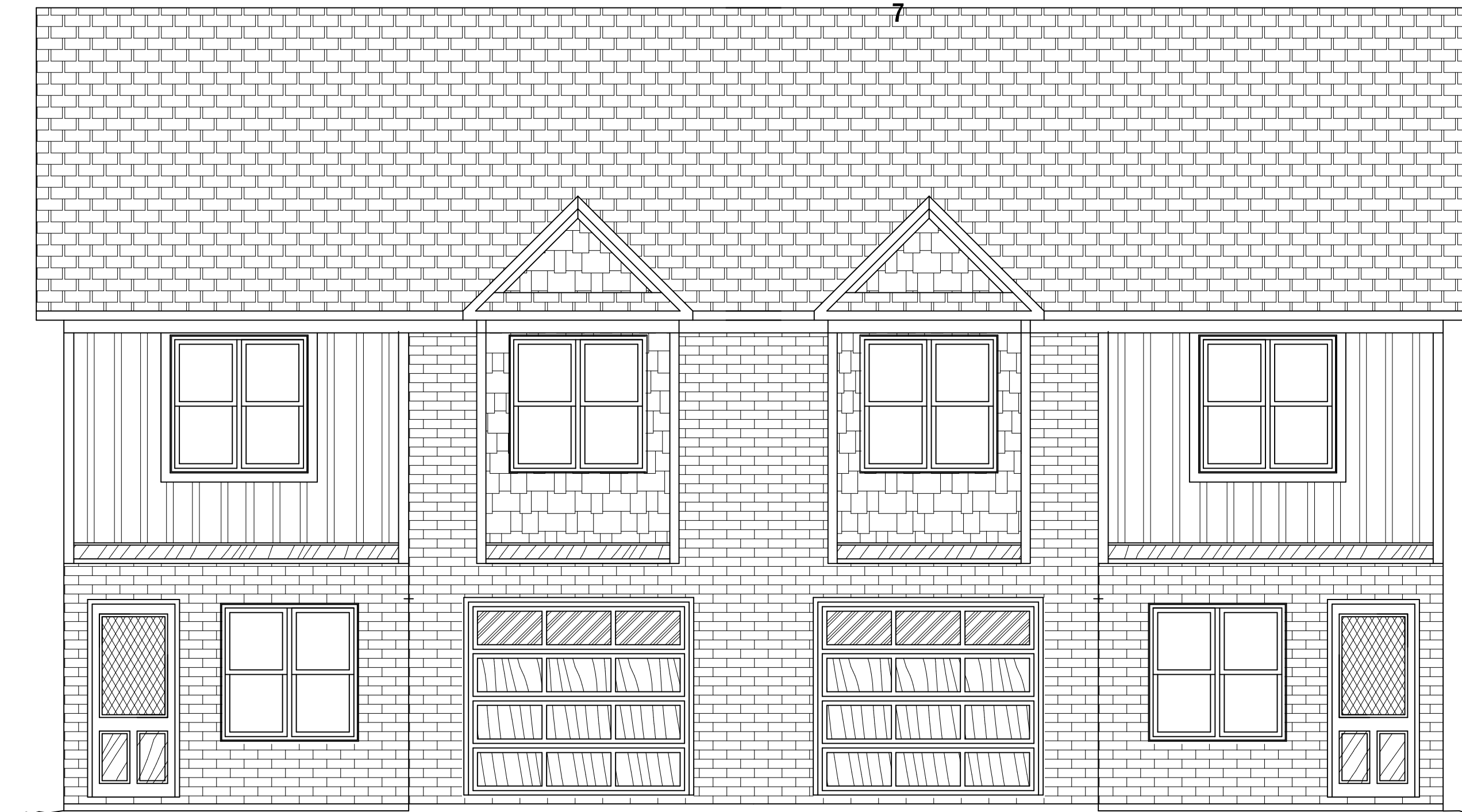
FRONT ELEVATION "A"