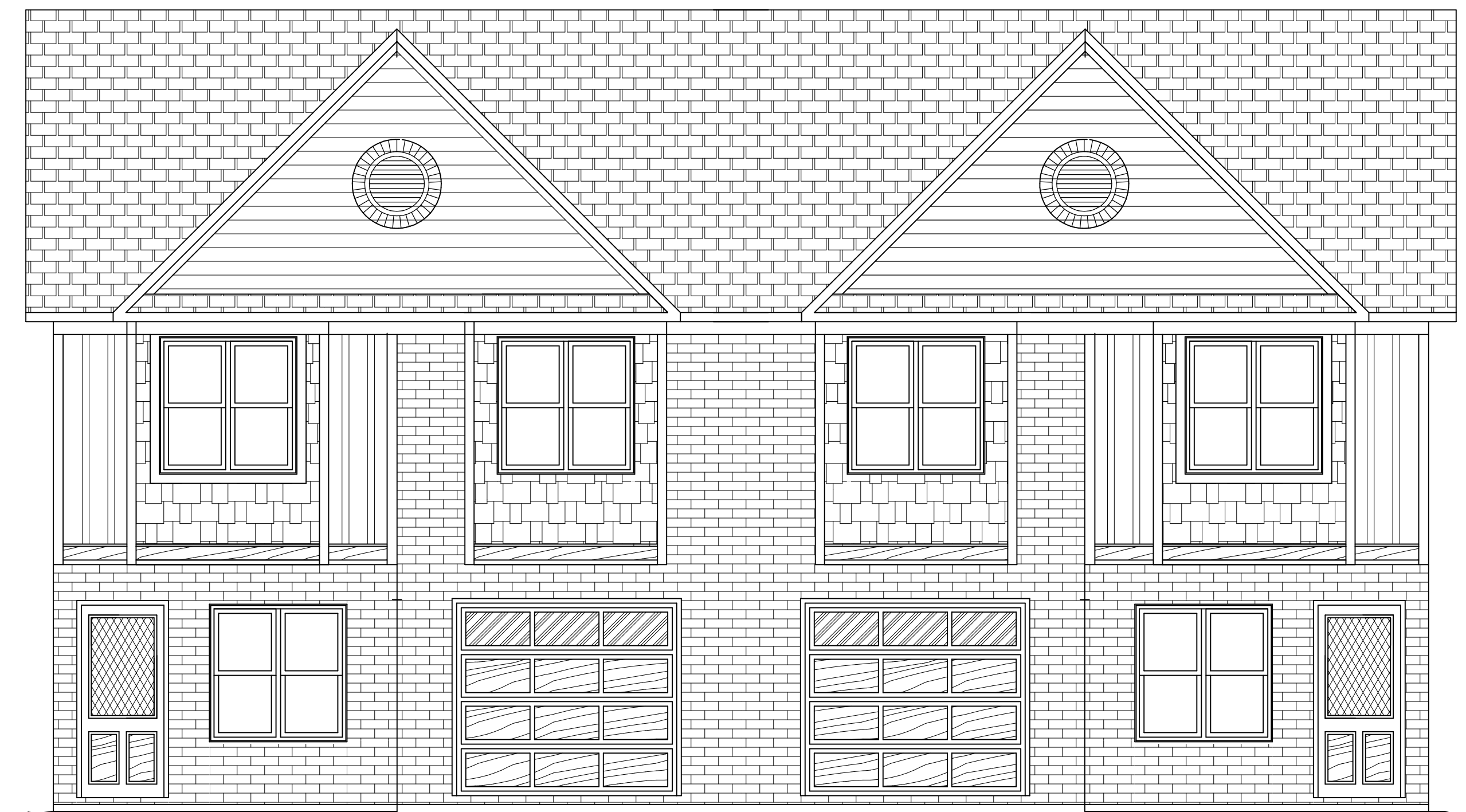
FRONT ELEVATION "D"