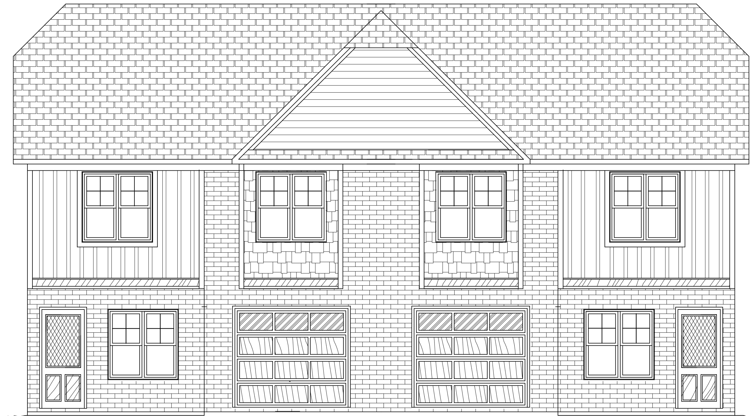
FRONT ELEVATION "C"