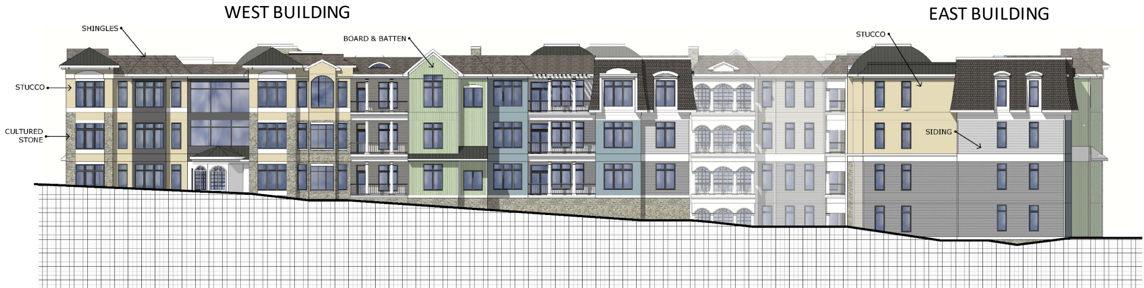
WEST FACING ELEVATION