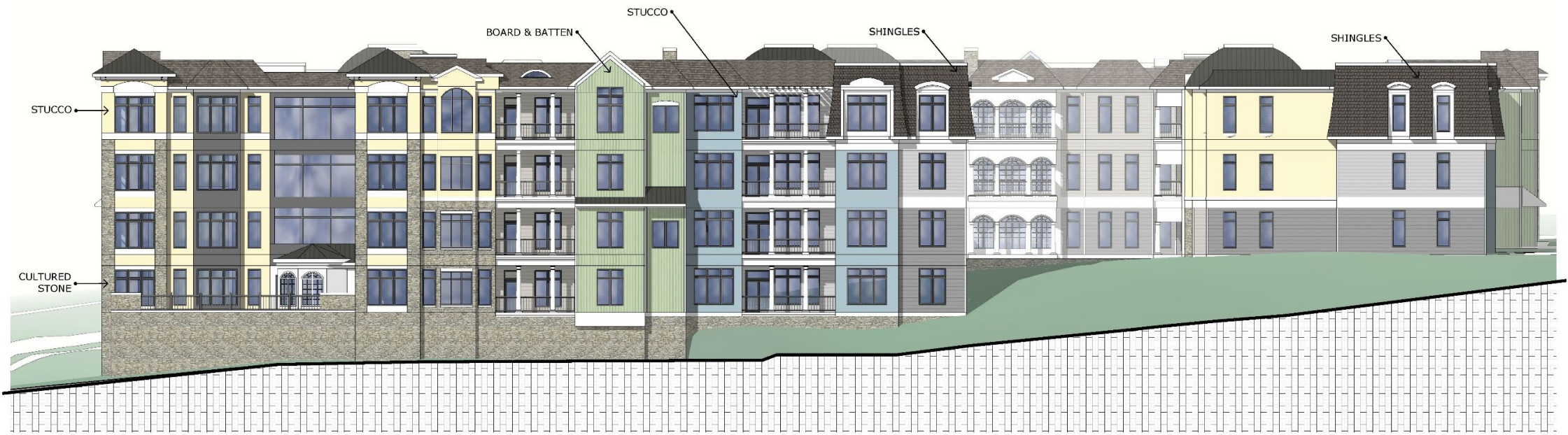
EAST FACING ELEVATION