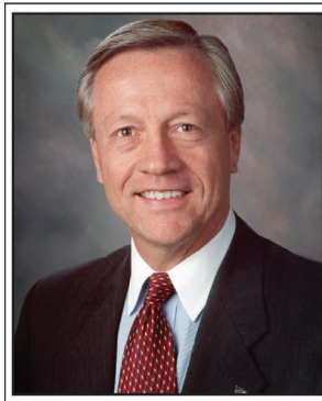
Allen Joines Mayor