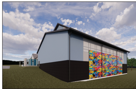
Proposed Belview Recreation Center Gymnasium and Community Mural Wall Image credit: McKissick Architecture