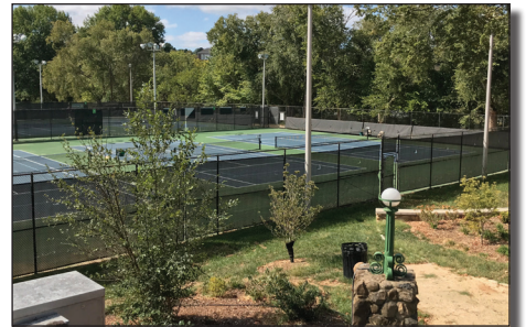
Hanes Park Tennis Courts Proposed for Renovation