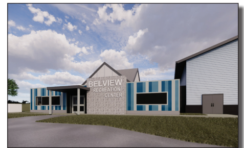
Proposed Renovation of Belview Recreation Center Image credit: McKissick Architecture