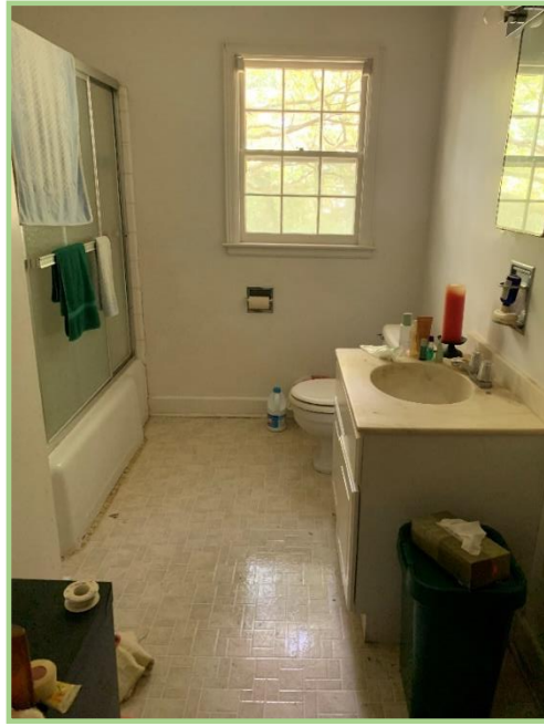
964 Kearns Avenue Current conditions 9/1/2021