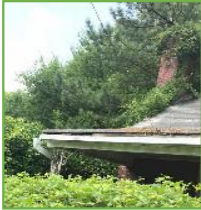
Soffit and gutter deficiencies cited by officer 7/2018