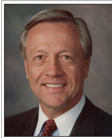
Allen Joines Mayor