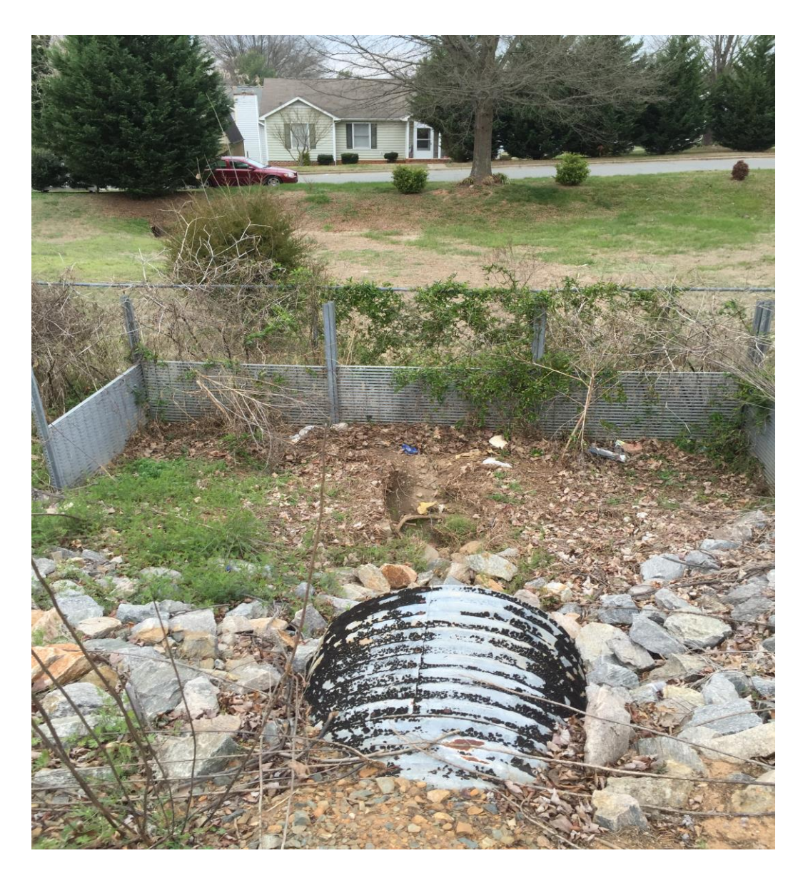
View looking west from rail road into Ms. Pollock's property.