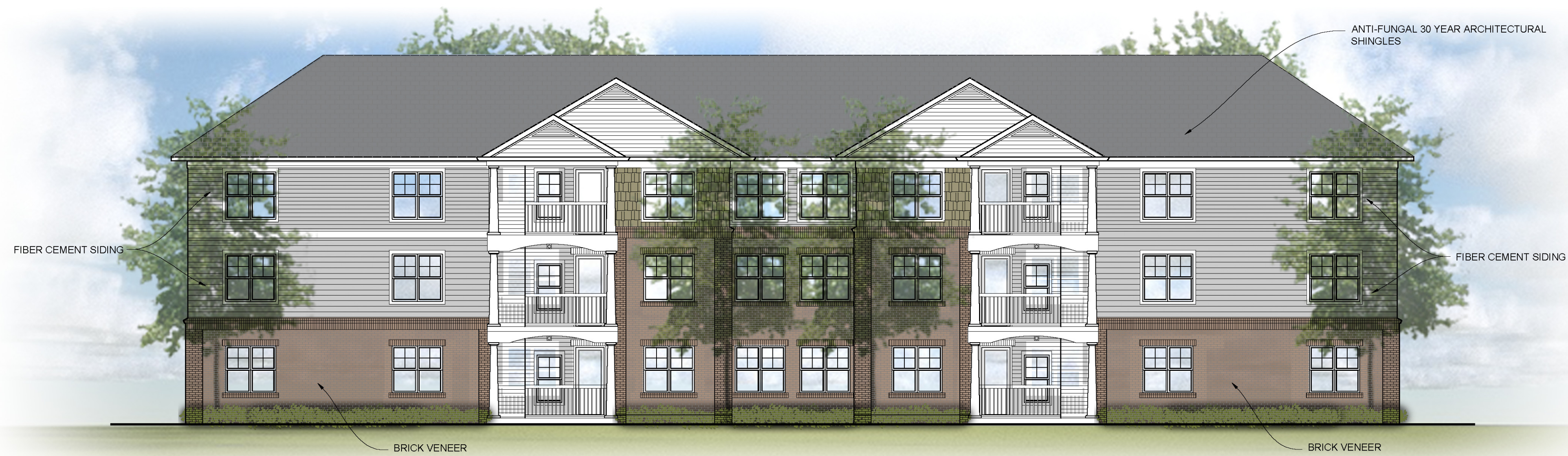
2 BUILDINGS 100 - 800 - REAR ELEVATIONS 1/8" = 1'-0"