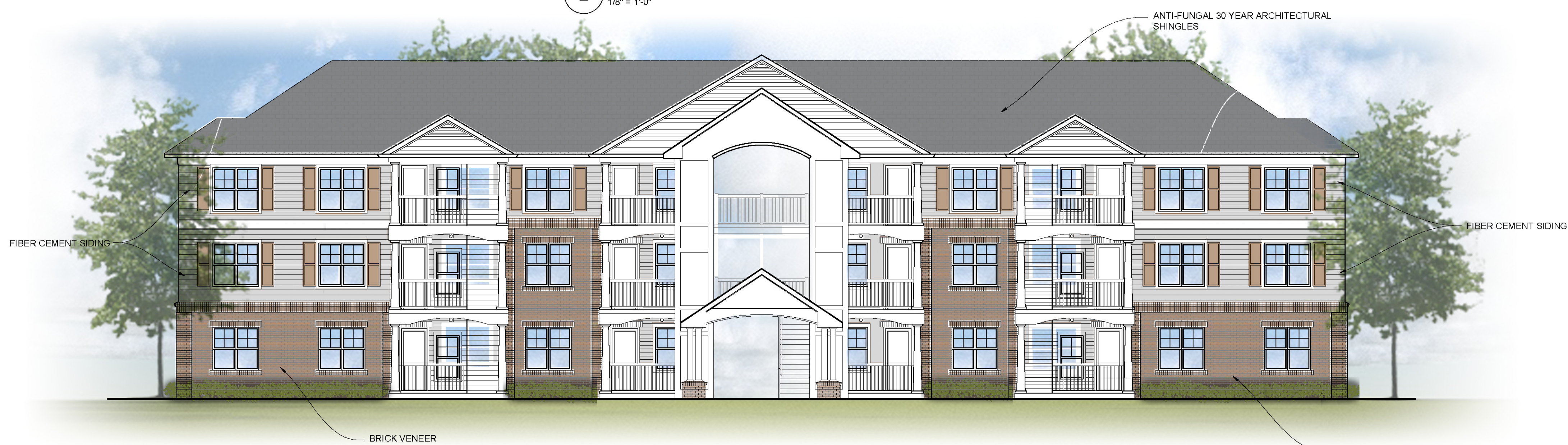
1 BUILDINGS 100 - 800 - FRONT ELEVATIONS (PARKING LOT) 1/8" = 1'-0"