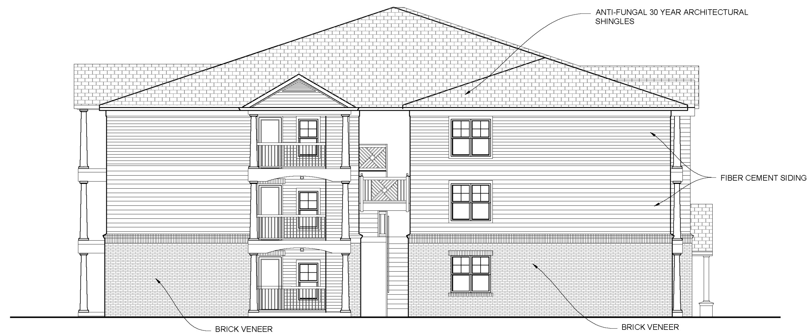
3 BUILDINGS 100 - 800 - LEFT SIDE ELEVATIONS 1/8" = 1'-0"