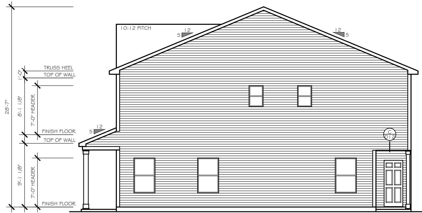
RIGHT ELEVATION SCALE: 1/8" = 1'-0"