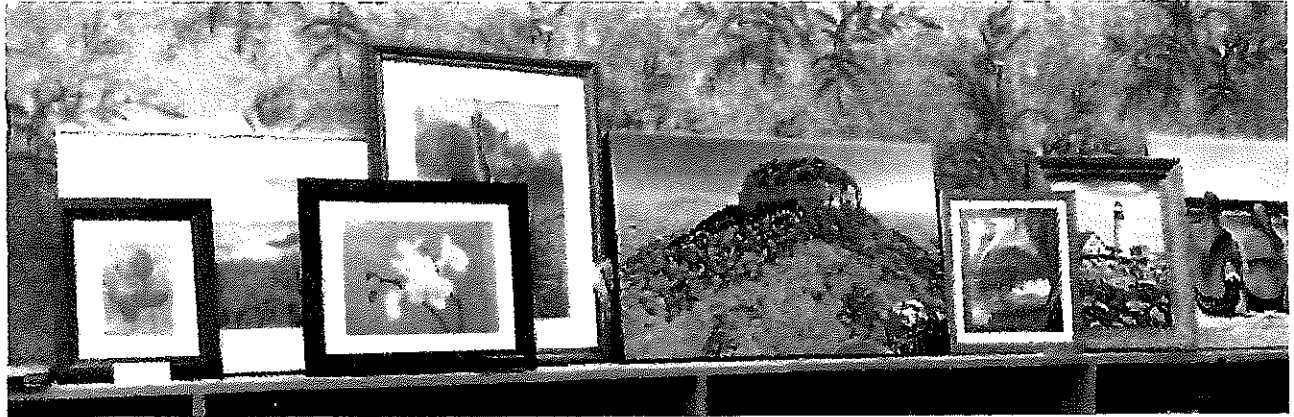
Exhibit with Us

All members in good standing are encouraged to display their art at our Community Exhibit sites. These businesses welcome our artists. Artwork is displayed for two months at a time. We coordinate several group shows as well as a number of solo shows. Sales are handled by individual arrangement between the artist and the buyer. There is no fee or commission required to participate and sell art in the shows. For more information, please contact our volunteer Community Exhibits Coordinator.