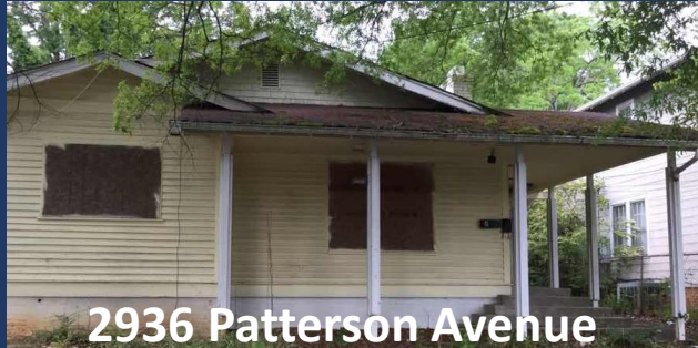
2936 Patterson Avenue