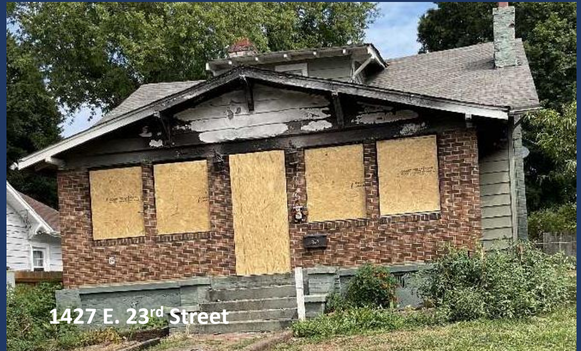
1427 E. 23 rd Street