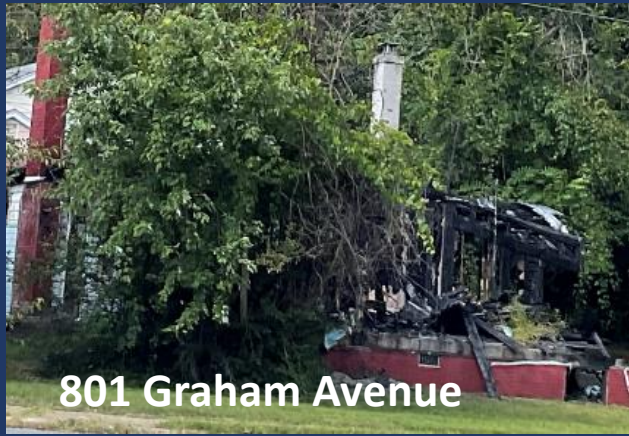
801 Graham Avenue