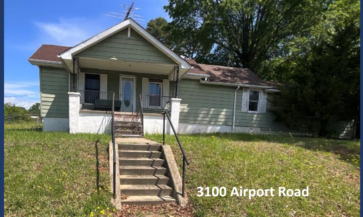
3100 Airport Road