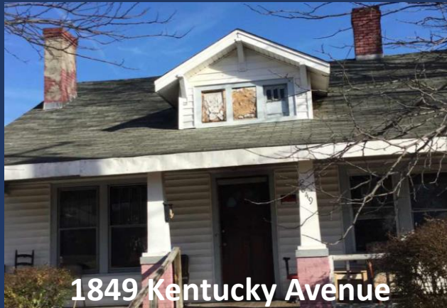
1849 Kentucky Avenue