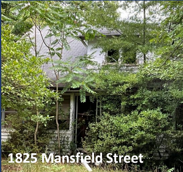
1825 Mansfield Street