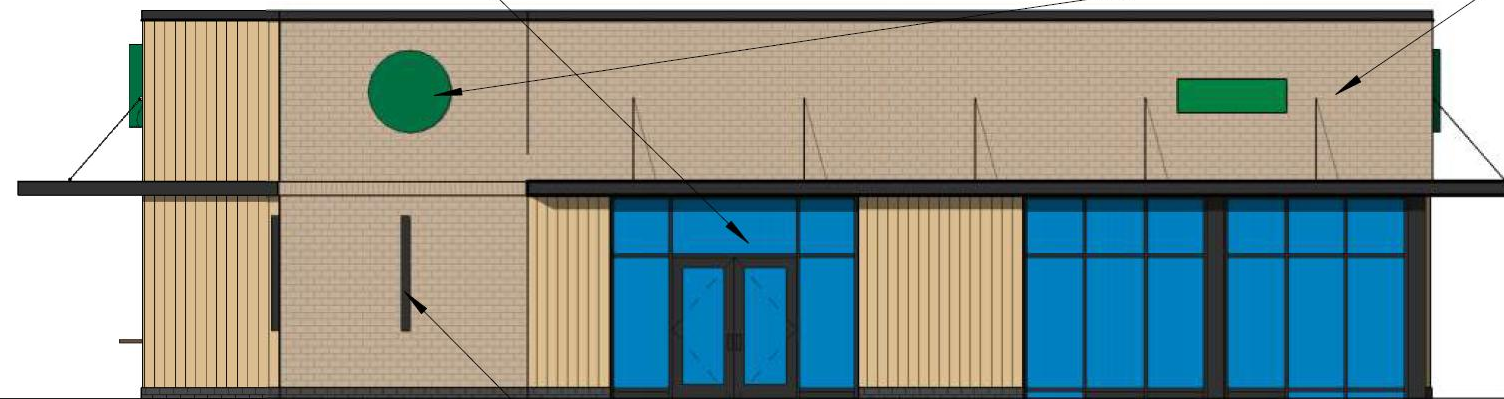
4 ENTRANCE ELEVATION 3/32" = 1'-0"