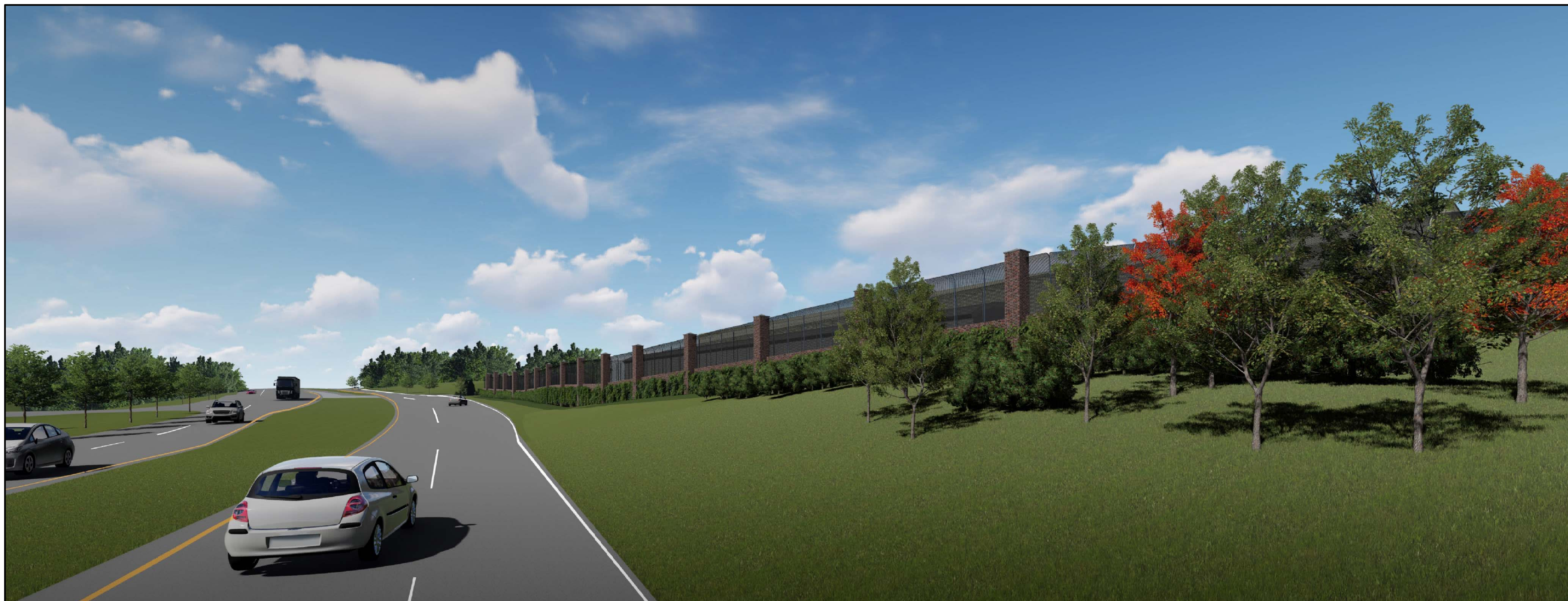
1 SILAS CREEK PARKWAY LOOKING SOUTH NO SCALE