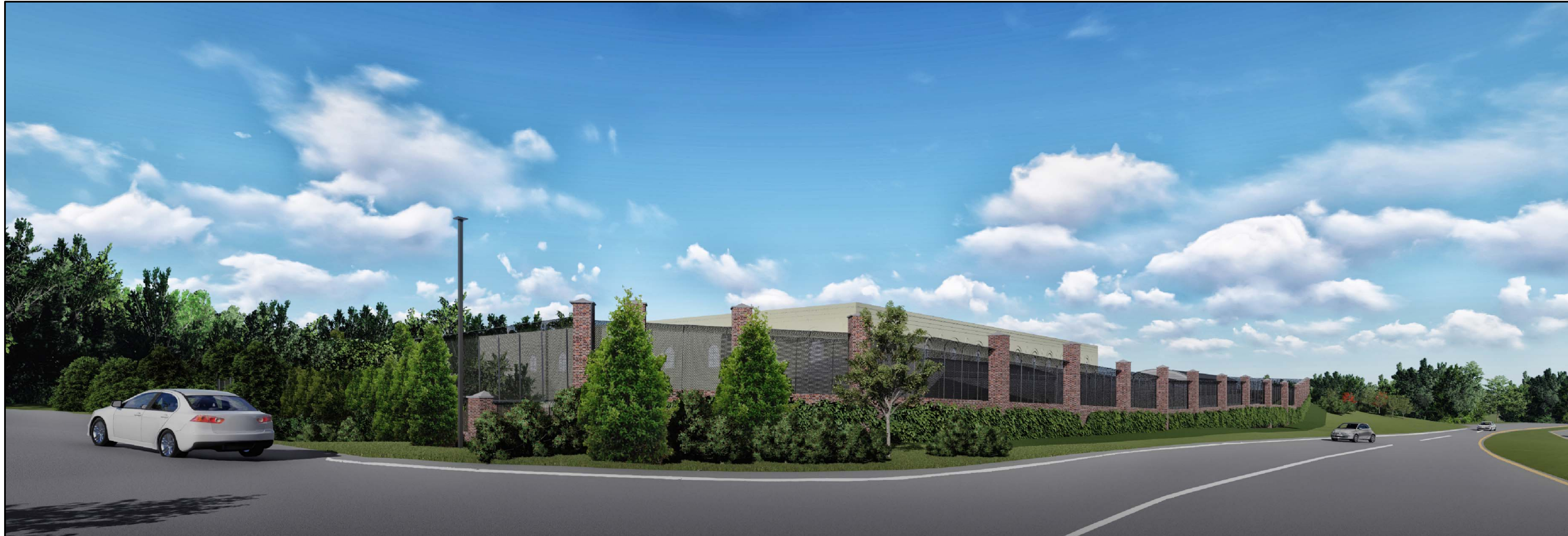
2 SILAS CREEK PARKWAY LOOKING NORTH NO SCALE