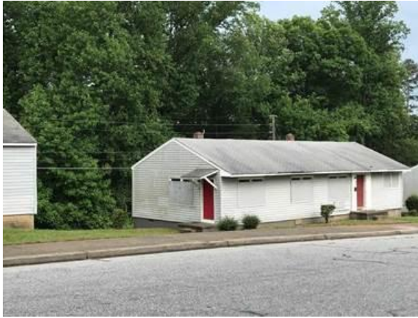
111, 113 Lakeview Boulevard – all connected