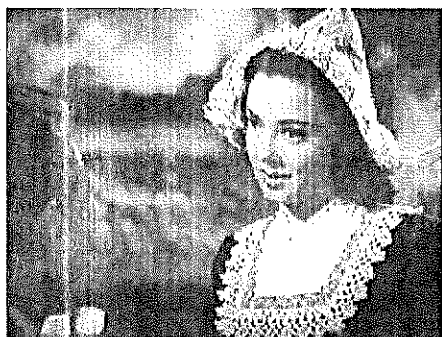
Grayson as Billie Van Maaster in Seven Sweethearts .