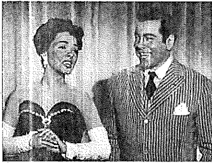
with Mario Lanza in The Toast of New Orleans

In 1950, Grayson was once again partnered with Lanza, and portrayed an opera singer in The Toast of New Orleans , and performed the Academy-Award-nominated song "Be My Love". While shooting the Madama Butterfly scene in the film, Lanza kept attempting to french kiss Grayson, which Grayson claimed was made even worse by the fact that Lanza would constantly eat garlic before shooting. Grayson went to costume designer Helen Rose, who sewed pieces of brass into Grayson's gloves. Any time Lanza attempted to french kiss her after that, she hit him with the brass-filled glove. [25]