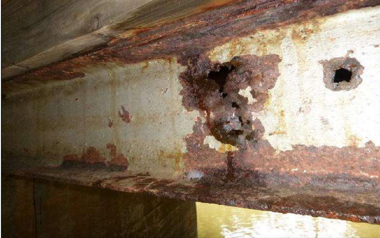
Corrosion of support beams