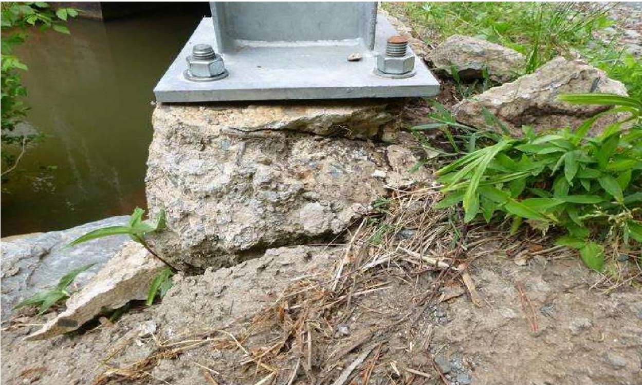
Concrete damage to railing and abutment structures