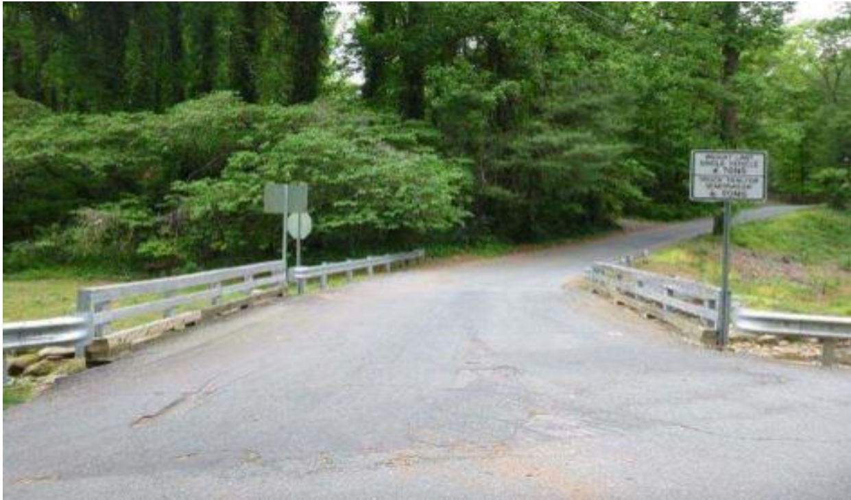
West Lakeview Drive Bridge