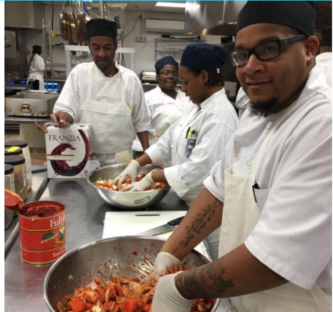
Shared Commercial Kitchen with Triad Community Kitchen

Food Entrepreneurs —Based on Cincinnati’s Findlay Kitchen model, we expect 70% of the 70 food entrepreneurs to be women or minority owned, neighborhood based businesses. With the attached 15,000 SF 1007 Market, we will offer neighborhood entrepreneurs an effective pathway from an idea to a state of the art commercial kitchen (with full incubator support services) to a temporary “pop up” for testing out their product and, ultimately, on to a full bricks and mortar enterprise.