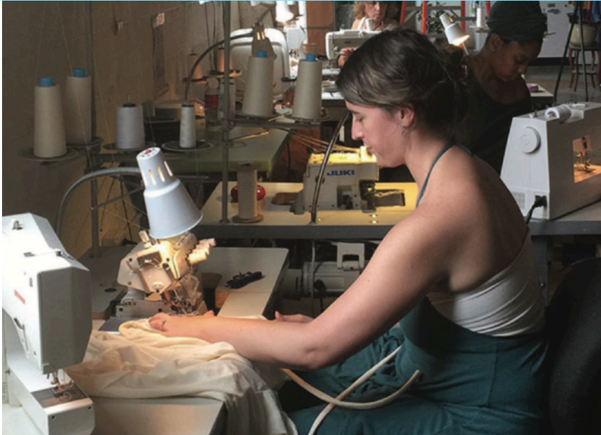
GAIA Conceptions Organic Clothing Design & Production

1001 is about long term, measurable benefits for the broader Winston-Salem community. Intense community focused programming will embrace all neighborhoods into the arts and innovation economy.