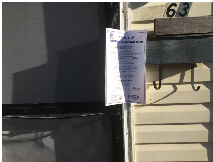
IMAGE DESCRIPTION 2063 Bowen Blvd

CODE CASE NBR IMAGE DATE 2016020947 1/31/2018