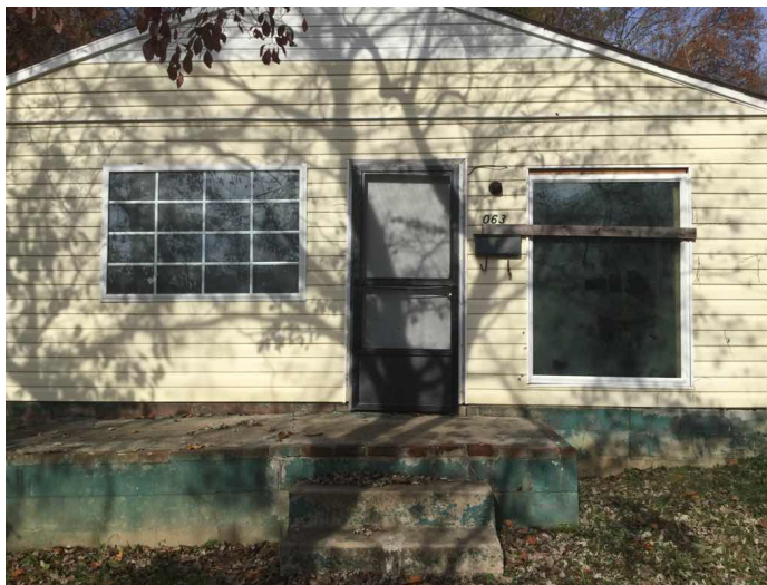
IMAGE DESCRIPTION 2063 Bowen Blvd

CODE CASE NBR IMAGE DATE 2016020947 1/31/2018