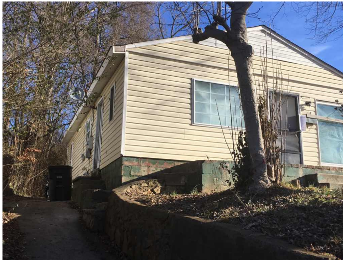
IMAGE DESCRIPTION 2063 Bowen Blvd

CODE CASE NBR IMAGE DATE 2016020947 1/31/2018