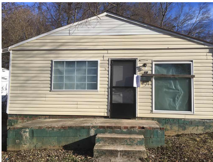
IMAGE DESCRIPTION 2063 Bowen Blvd

CODE CASE NBR IMAGE DATE 2016020947 1/31/2018