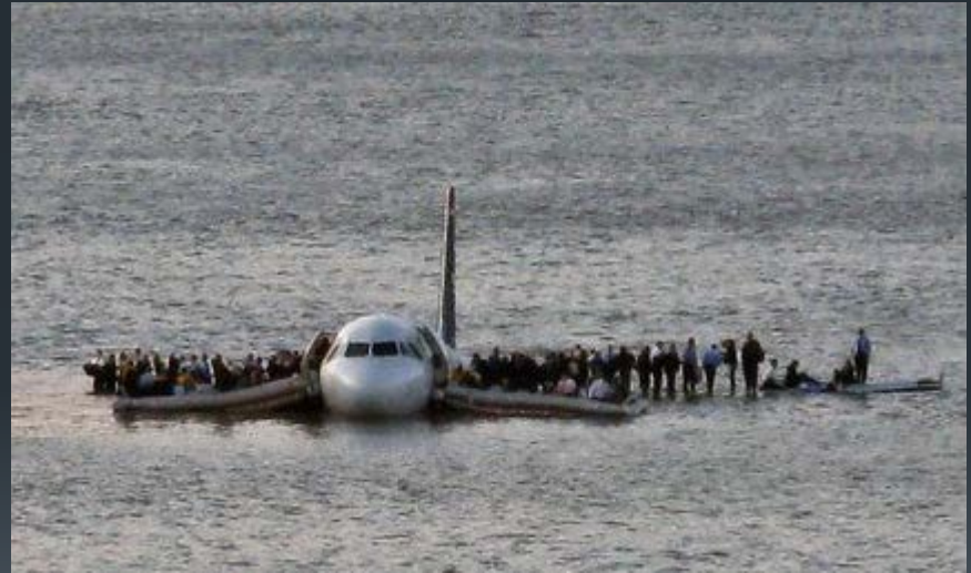
US Airways Flight 1549 – Miracle on the Hudson. January 15, 2009

Airports reduce the risk of wildlife strikes through integrated wildlife management programs. These programs include changes to the habitat at and in the vicinity of the airport and methods to disperse or remove the birds and other wildlife that pose a risk to aviation safety.