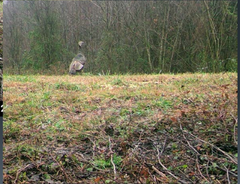
CAMERA 1 15 DEC 2018