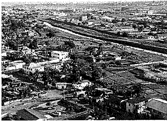
Most of Angelou's time in Africa was spent in Accra, Ghana, shown here in 2008.