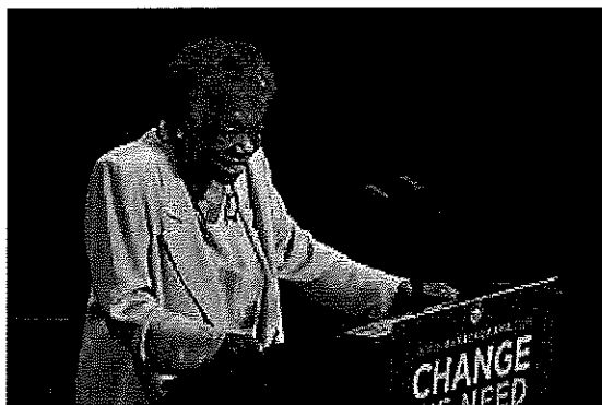
Maya Angelou speaking at a rally for Barack Obama, 2008

She returned to the southern United States in 1981 because she felt she had to come to terms with her past there and, despite having no bachelor's degree, accepted the lifetime Reynolds Professorship of American Studies at Wake Forest University in Winston-Salem , North Carolina, where she was one of a few full-time African-American professors. [67][68] From that point on, she considered herself "a teacher who writes". [69] Angelou taught a variety of subjects that reflected her interests, including philosophy, ethics, theology, science, theater, and writing. [70] The Winston-Salem Journal reported that even though she made many friends on campus, "she never quite lived down all of the criticism from people who thought she was more of a celebrity than an intellect...[and] an overpaid figurehead". [68] The last course she taught at Wake Forest was in 2011, but she was planning to teach another course in late 2014. Her final speaking engagement at the university was in late 2013. [71] Beginning in the 1990s, Angelou actively participated in the lecture circuit [72] in a customized tour bus, something she continued into her eighties. [73][74]