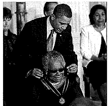
US President Barack Obama presenting Angelou with the Presidential Medal of Freedom, 2011