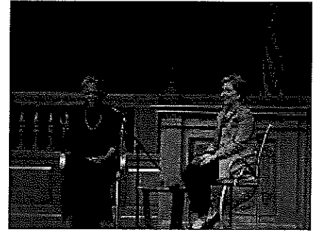
Angelou and Hillary Clinton at an event in North Carolina in 2008