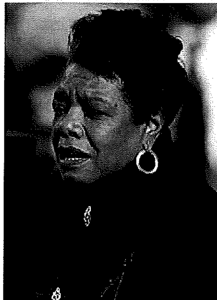
Angelou reciting her poem "On the Pulse of Morning" at US President Bill Clinton's inauguration, January 20, 1993