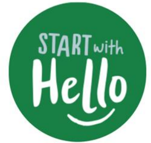
START WITH HELLO