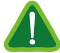
SAFETY ASSESSMENT AND INTERVENTION