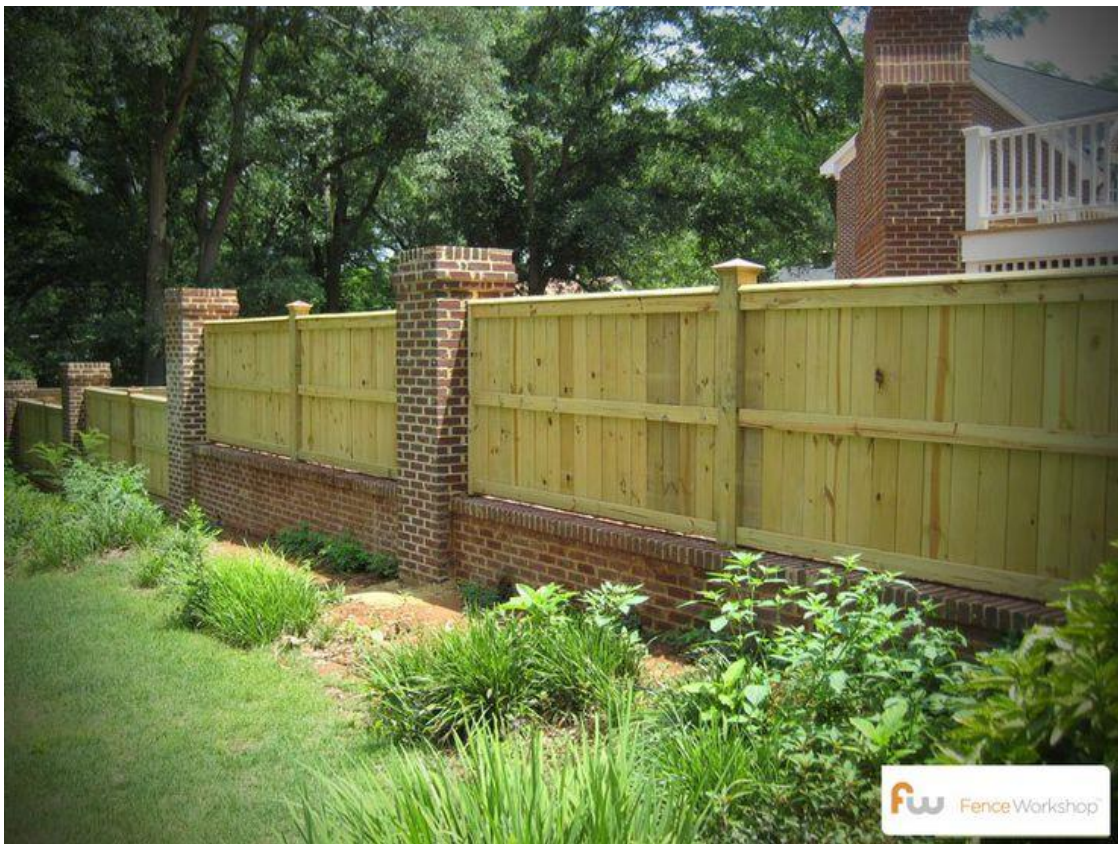
Masonry boundary fence.