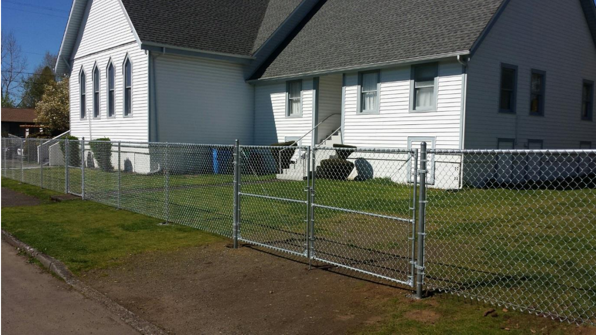
Opacity of 50% or less (50% or less of the area of the fence is not able to be seen through).