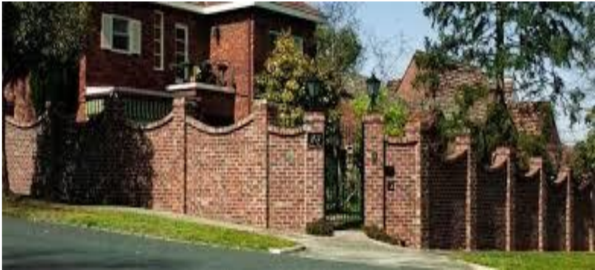
Masonry boundary wall.