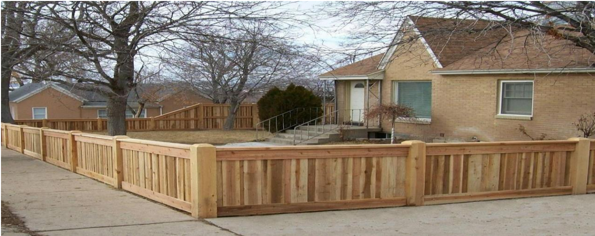
Not greater than 4 feet tall.