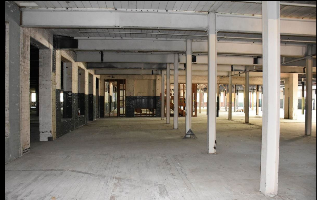
First Floor, looking East in 1935 Addition