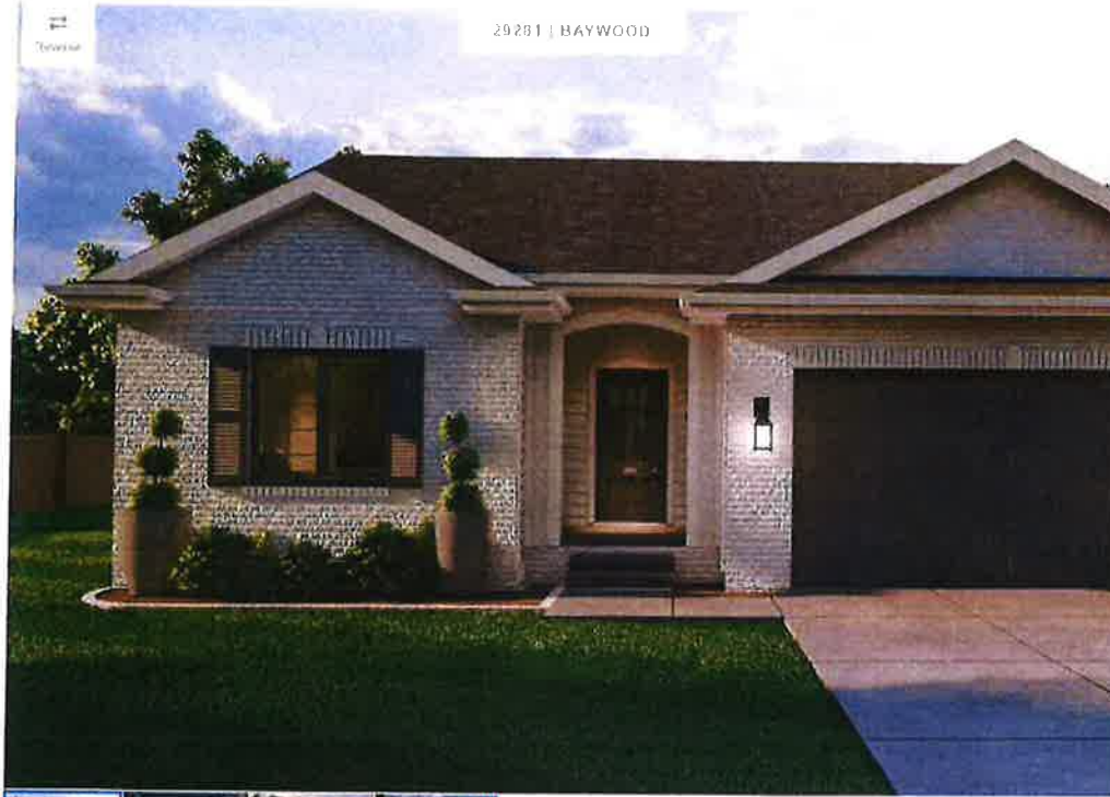
29281 | BAYWOOD

Join the 150K+ Home AHP Advantage Club. Receive 5% Silver Member Savings!