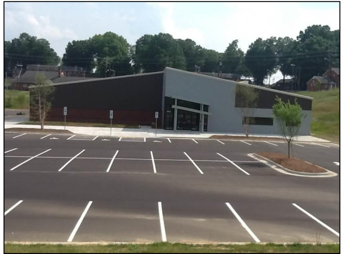
Brookwood Business Park Speculative Building

Objectives for FY19 are: (1) to approve four new small business loans leading to job creation and investment in the Neighborhood Revitalization Strategy Area (NRSA); (2) to expand marketing efforts and partnering opportunities of gap financing with local commercial lenders; (3) to expand technical assistance and follow-up efforts offered to entrepreneurs, entrepreneurial networks, and existing businesses; and (4) to work with community development corporations in the NRSA to facilitate identification of available idle or vacant properties suitable for the business needs of specific developers and businesses seeking to relocate within the community.