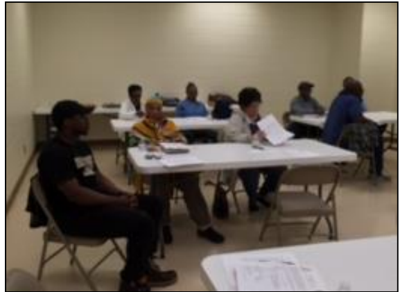
Community Meeting 2-20-2018

An ongoing review and assessment of housing needs and program responsiveness is included in the CHCD and public review process. As a part of the Continuum of Care application process, an update of homeless and special population housing needs is undertaken each year. To implement the Homeless Emergency Assistance and Rapid Transition to Housing Act of 2009 (HEARTH Act), the City has also met regularly with the Continuum of Care and its Operating Cabinet, Commission on Ending Homelessness, homeless services providers, and the State of North Carolina to discuss potential changes to homeless assistance programs, the use of Emergency Solutions Grant and Continuum of Care funds, and coordination of services.