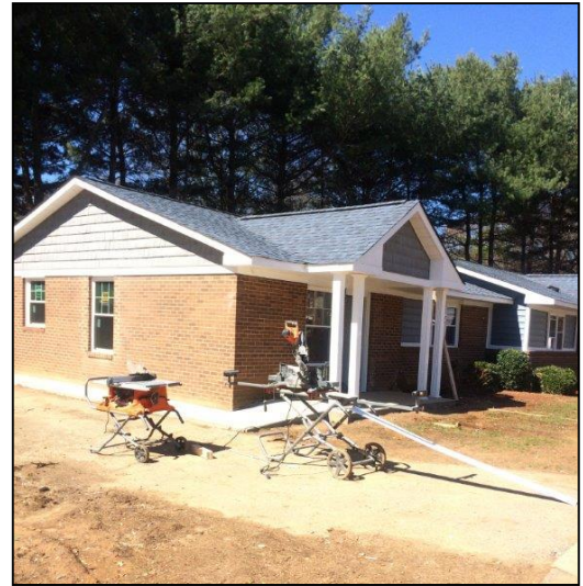
Drayton Pines Rehab

The City has provided some funds, and rehabilitation of two multifamily rental developments are under way by the Housing Authority of Winston-Salem. Drayton Pines, 44 units for families, is undergoing substantial rehabilitation using CDBG funds. The Housing Authority acquired New Hope Manor, which is located in HAWS' Choice Neighborhoods Planning Area, to help stabilize the neighborhood. General obligation bonds approved by Winston-Salem voters in 2014 are being used for acquisition, to demolish buildings that are beyond repair, and to bring the remaining units to Minimum Housing Code.