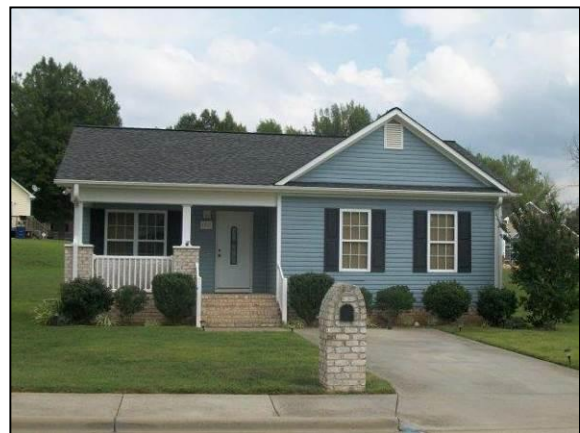
House in Glenn Oaks

The use of HOME funds for multi-family projects is principally reserved, as a policy decision, for Low-Income Housing Tax Credit projects or projects sponsored by non-profit, public agency entities, given the complexities of the HOME Program affordability restrictions; however, proposals may be reviewed on a case-by-case basis for projects serving special needs populations. One new construction Tax Credit project approved in a prior year will be under construction in FY19.