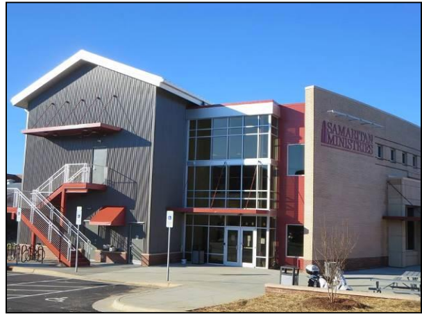
Samaritan Ministries Shelter

Standards for providing ESG assistance as well as performance standards for evaluating activities and consulting with homeless or formerly homeless individuals are described in Appendix F. As the collaborative applicant for the Winston-Salem/Forsyth County Continuum of Care, the City is involved in planning and developing programs to meet the needs of individuals and families in the community that are homeless or at risk of homelessness and works with service providers that assist them. The required 100% match will be provided by the subrecipient agencies.