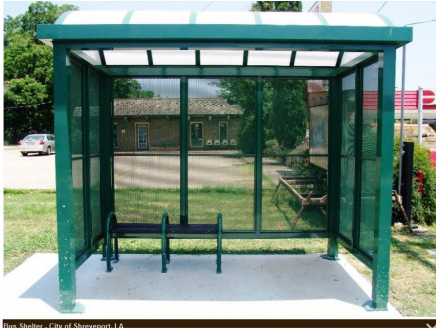
Bus Shelter - City of Shreveport, LA